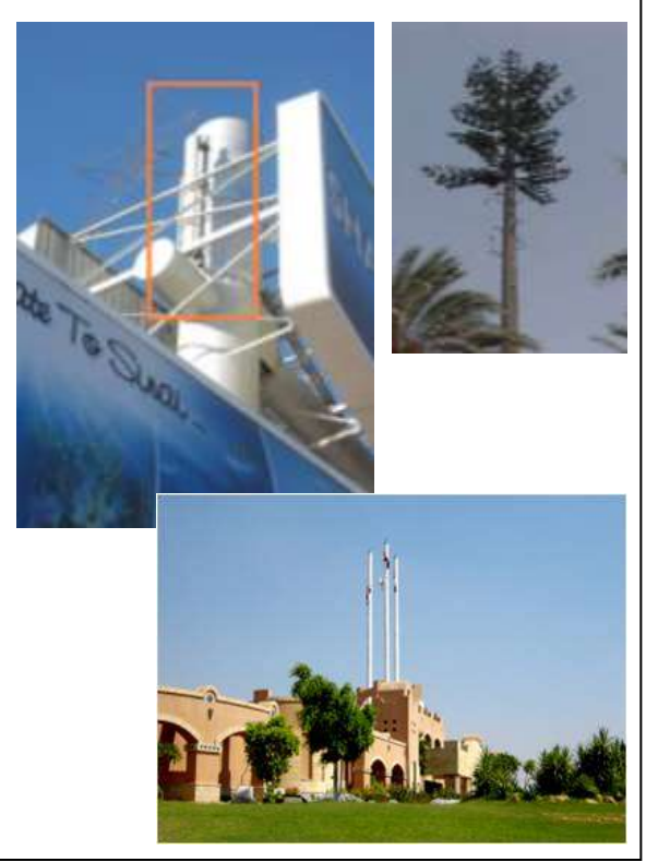
The Egyptian Company for Mobile Services (Mobinil) - Corporate Presentation - January 1, 2010 Nile City TYPE OF CONFIDENTIALITY page 4